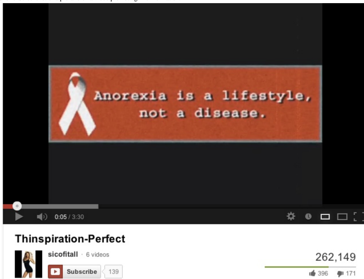
Figure 1. Screenshot of a pro-anorexia video promoting misinformation.